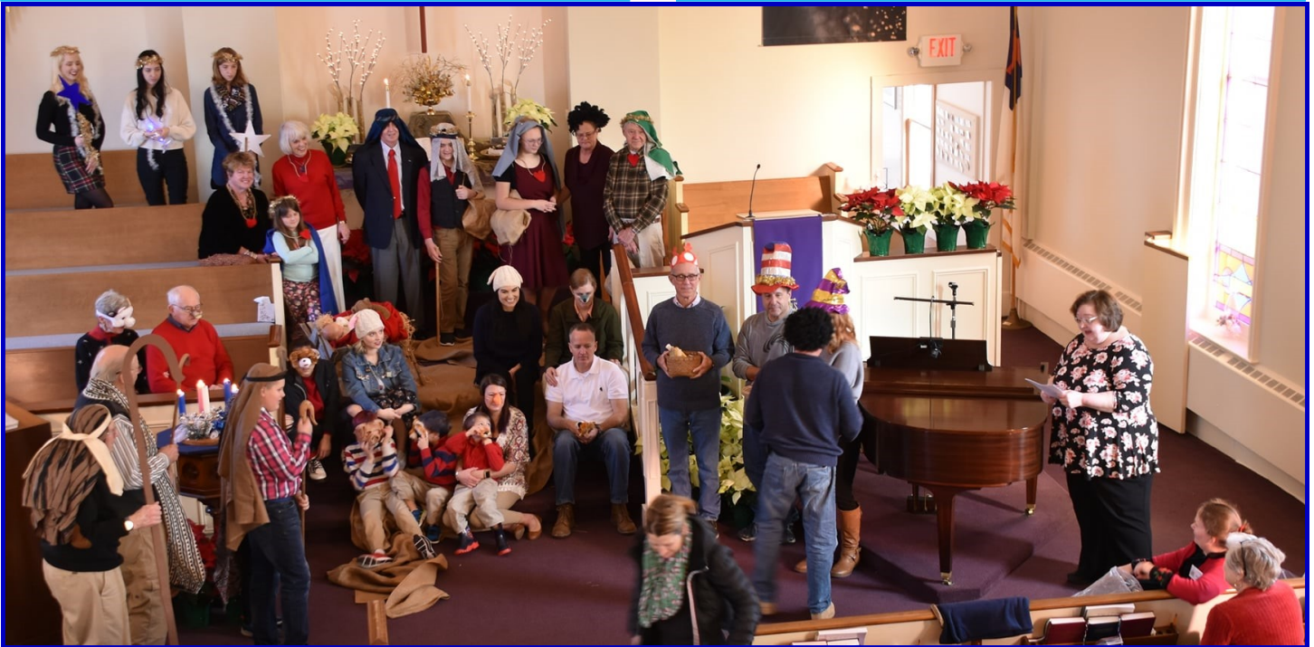
The No Fuss Christmas Pageant, 2019 (It was fantastic!)