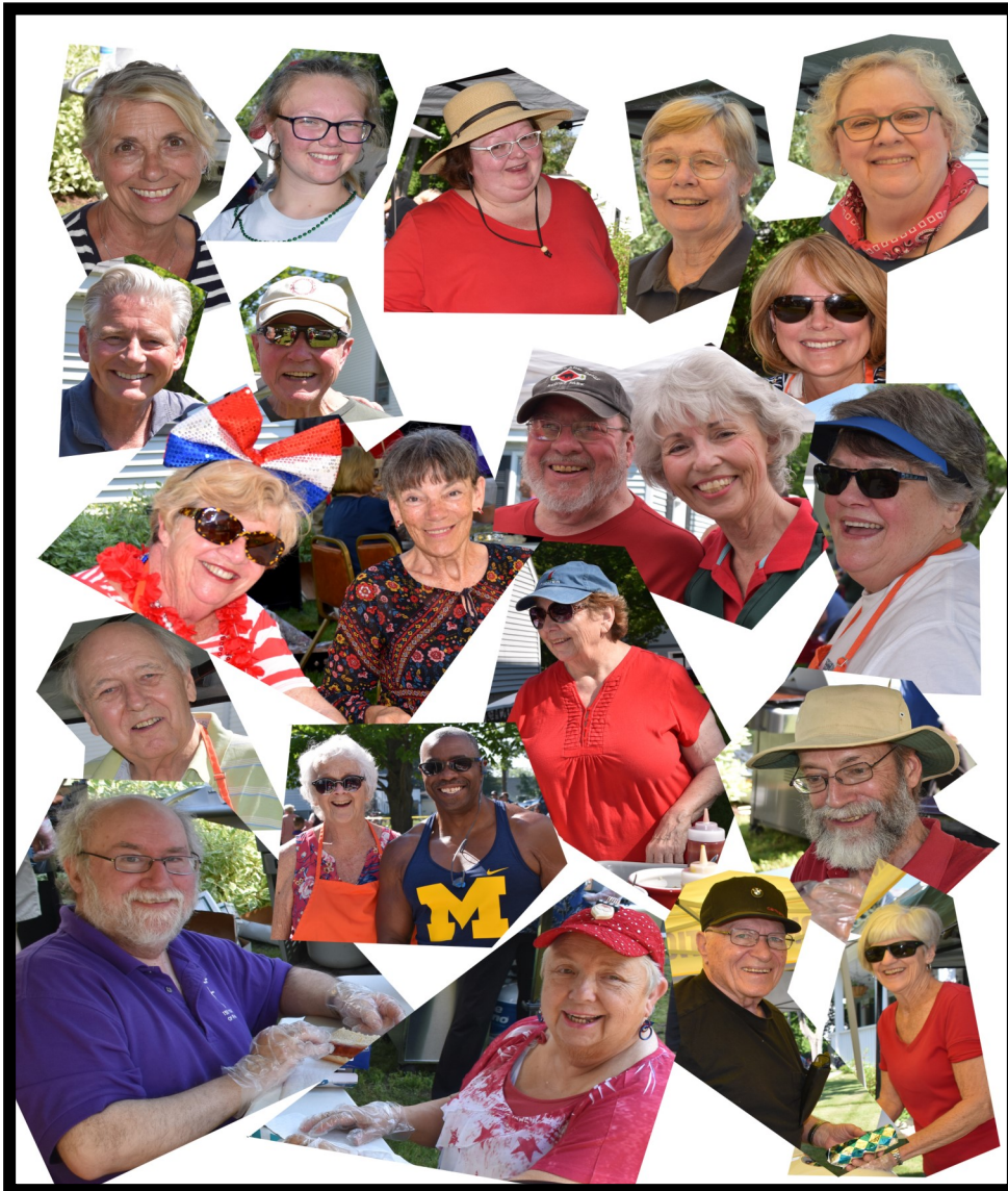
Our Koegel Hot Dog Grillers