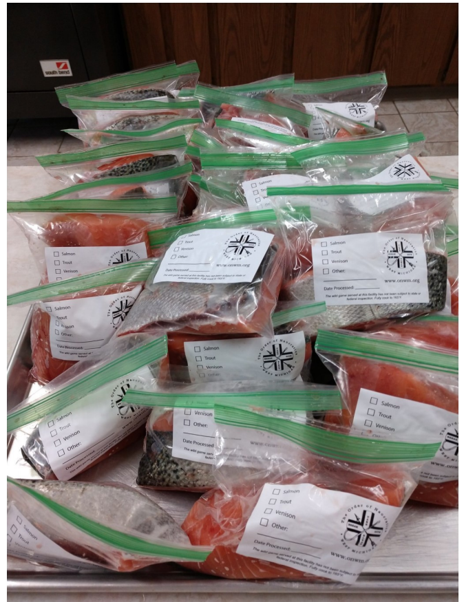
Fish for hungry bellies.

If you are interested in being a part of the wonderful mayhem, the greatest need for help is on Sunday afternoon about 2:00. You don't need to bring anything and you don't need to know how to clean fish. You won't even need any special clothing as it is amazing how slick it goes down at the fish cleaning station.