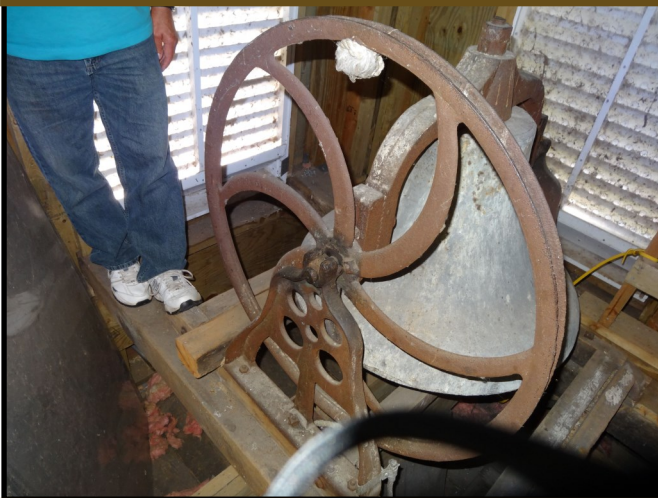
The steeple bell