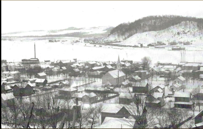
It is thought that the above photo was taken before 1920.