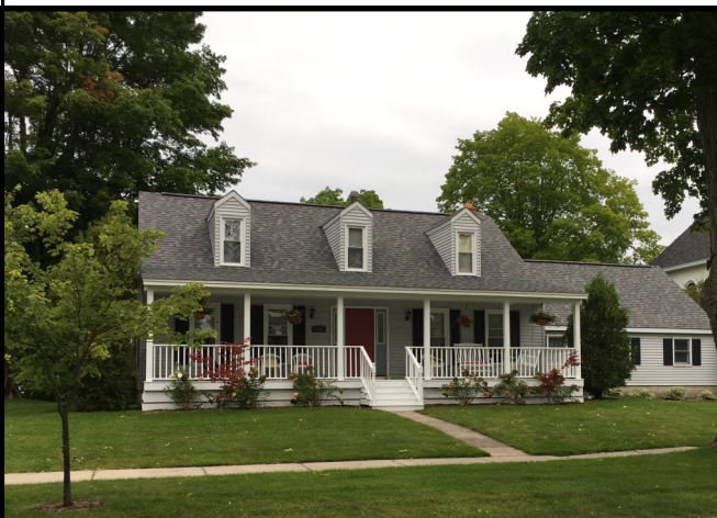
First Congregational Church of Frankfort Parsonage, 2016