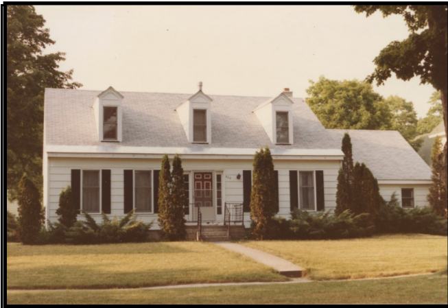
First Congregational Church of Frankfort Parsonage, 1980's