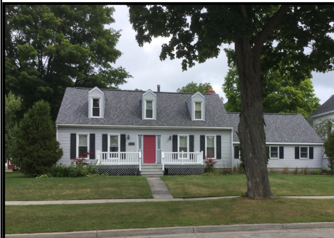
First Congregational Church of Frankfort Parsonage, 2015